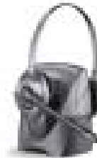
CS361N P/N 39261-02 P/N 39261-01