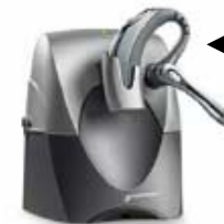
Voyager 510S P/N 72272-05 P/N 72272-04