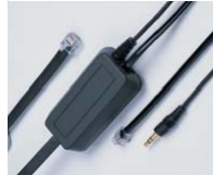
AP-1 P/N 36664-01